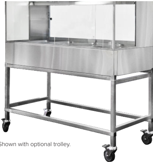
Shown with optional trolley.